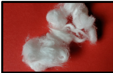
Pull apart the cotton wool