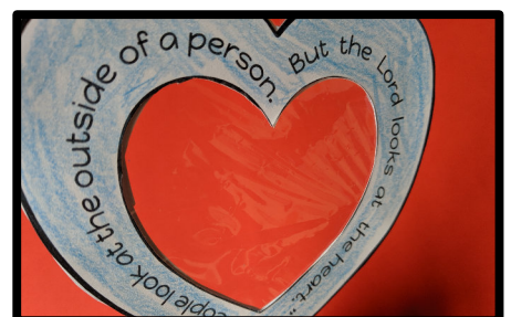
Glue both reverses together