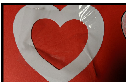
Stick clear plastic on reverse