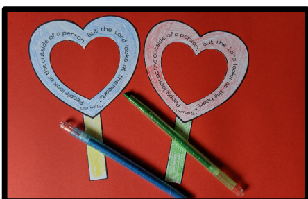
Colour and cut out