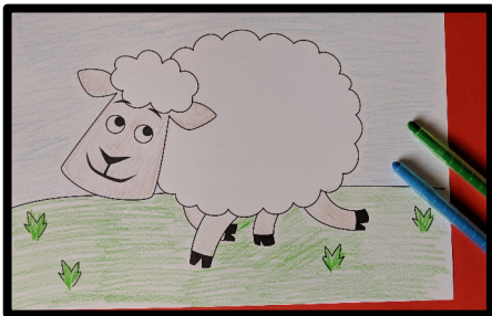
Colour in the page